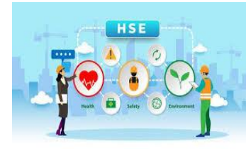
Health, Safety & Environment