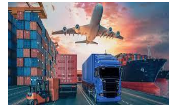
Transportation & Logistics