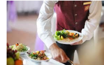
Hospitality & Tourism