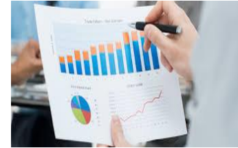
ICT (inclu. Data Analytics)